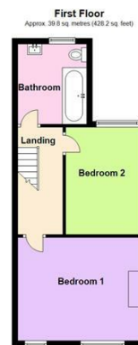
First Floor Approx. 39.8 sq. metres (428.2 sq. feet)

Bay Fronted 'EDWARDIAN' Home | POPULAR & COVENIENT Location | Blend of CHARACTER & MODERN LIVING | SIZEABLE WESTERLY Rear Garden | 'PERMIT' Parking. Situated on this sought after row with accommodation comprising an entrance canopy, porch, hall, lounge with feature fireplace and shutters, dining room, kitchen, two bedrooms and a bathroom. Externally, courtyard, lawned garden and 'Permit' parking.