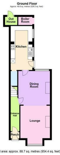
Total area: approx. 88.7 sq. metres (954.4 sq. feet)